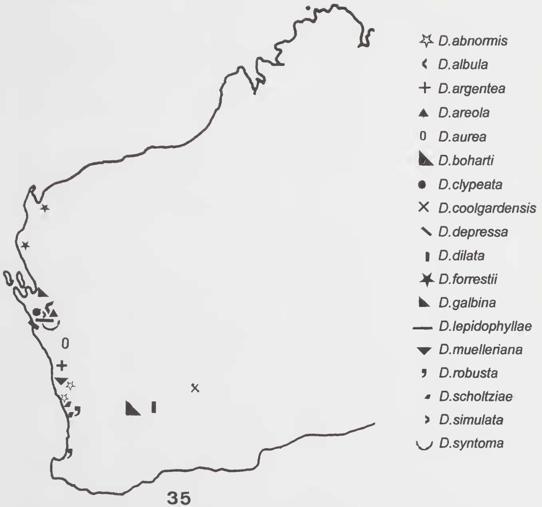
Figure 35 Known distribution of some bees of the genus Dasyhesma .

eye length 4.2; lower interocular distance 3.5; upper interocular distance 3.7; interantennal distance 1.0; antennocular distance 0.9; interocellar distance 1.2; ocellocular distance 1.0; labrum length 0.4; labial palp segment one longest; genal area narrower than eye seen from the side; malar space clearly evident; basitibial plate delineated by posterior carina only; inner hind tibial spur with 3–5 teeth; foveae of second tergum of metasoma about 6 x as long as wide; black in holotype.